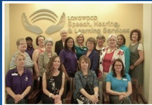
Shown above is the SHLS faculty and staff.

During Oktoberfest on Friday October 2, 2015 , SHLS will hold an Open House from 4:00 pm until 6:00 pm. Stop by to see the new building and meet the faculty and staff. There will be a free hearing screening available. We look forward to seeing you!